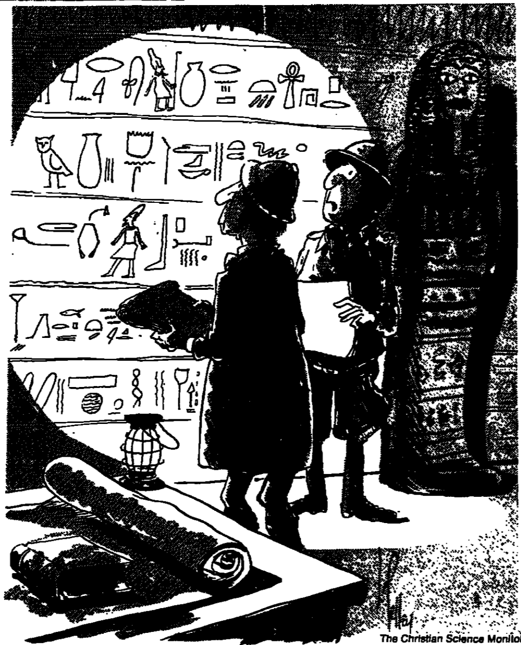
"It says negotiations between Israelites, Egyptians, and Philistines are proceeding slowly."

At the same time Sudan is being transformed into the breadbasket of the Arab World with funds from the Kuwait based Arab Fund for Economic and Social Development. The Khartoum agreement should help guarantee that these funds will continue to flow into Sudan.